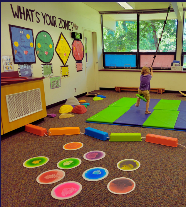
A Restorative Room with sensory and regulation tools for students at L.P. Brown.

While the pandemic has certainly shed light on how critical this investment is, the Foundation's commitment to our Mental Health Initiative (MHI) pre-dates COVID.