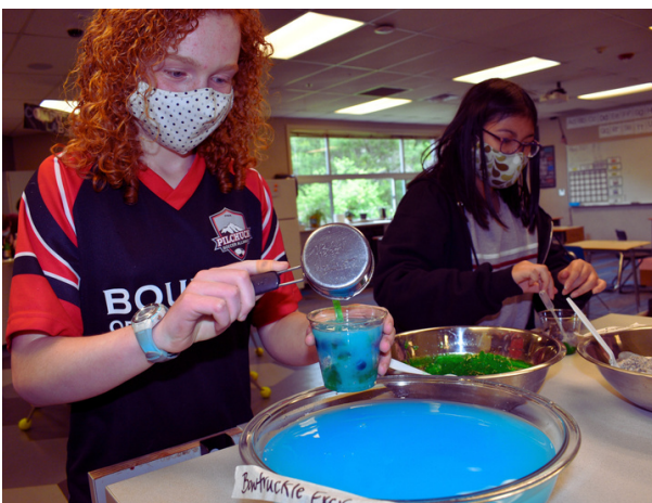
Students at Thurgood Marshall Middle School participate in extracurricular activities made possible by Foundation grants.